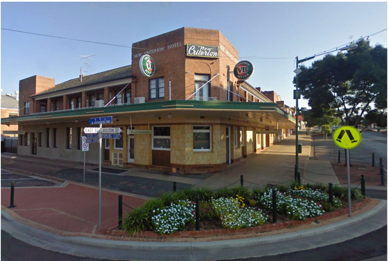
Street view Image of 100-106 East Street Narrandera

The statement has been prepared based on drawings prepared by Sherene Blumer and is submitted for and on behalf of Halls Accounting.