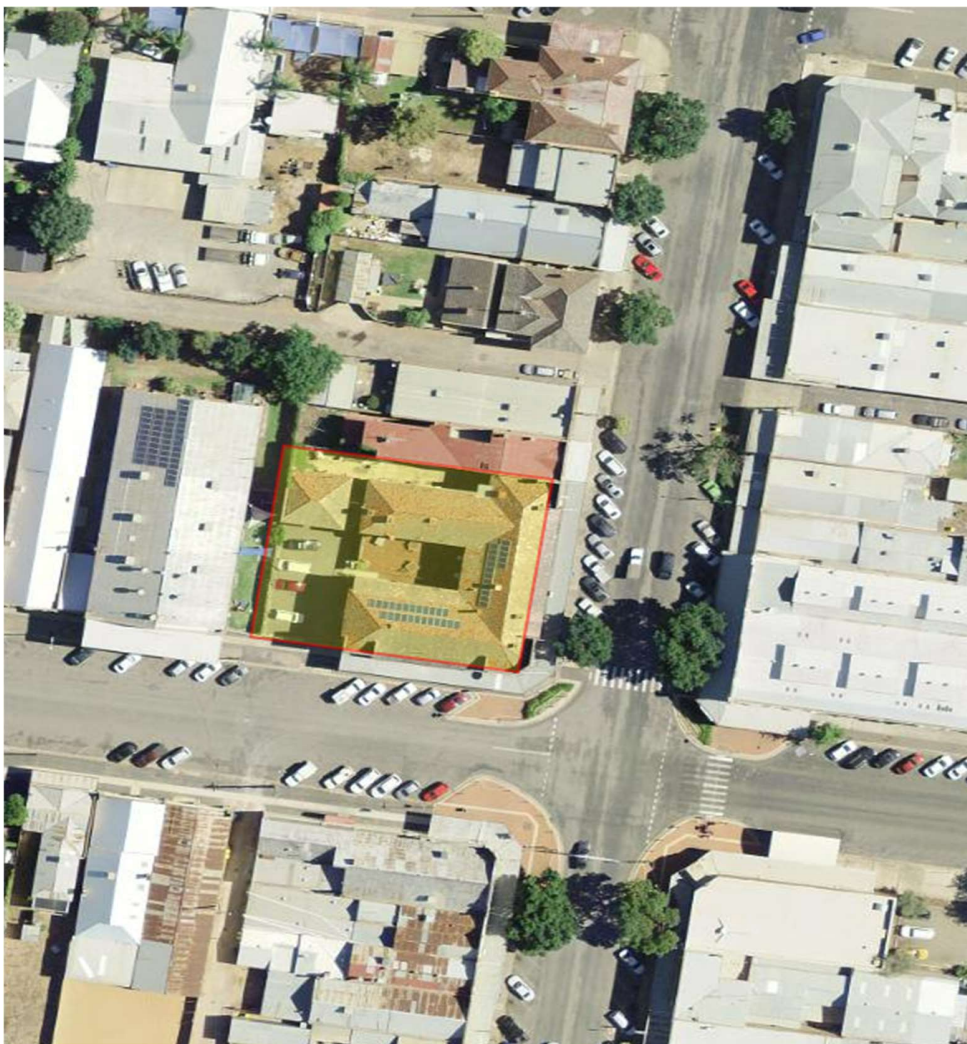
Development surrounding 100-106 East Street Narrandera

The development immediately surrounding the site is characterized by commercial premises.