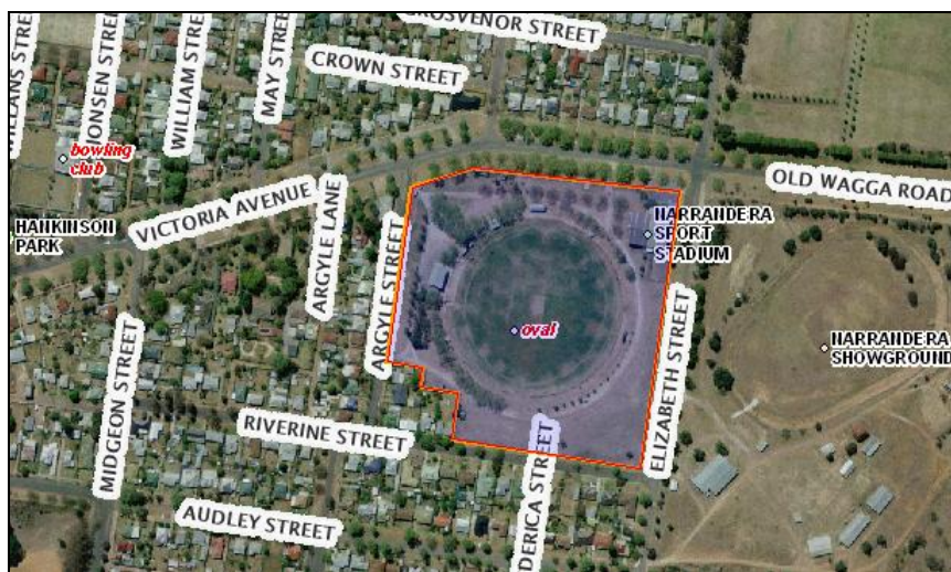
Figure 2: Narrandera Sportsground within the context of its surrounds (source Six Viewer 2011)

Several advertising signs are located around the Sportsground, which are managed by the Committee.